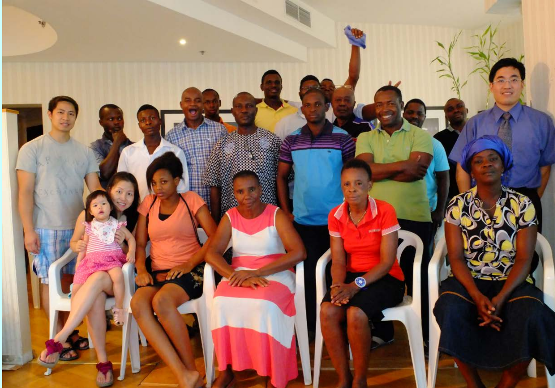
2014 Dubai Spiritual Convocation