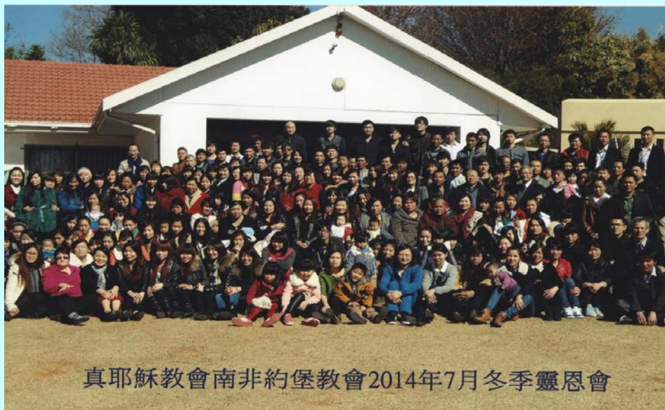
Winter Spiritual Convocation held in Johannesburg Church on July 2014