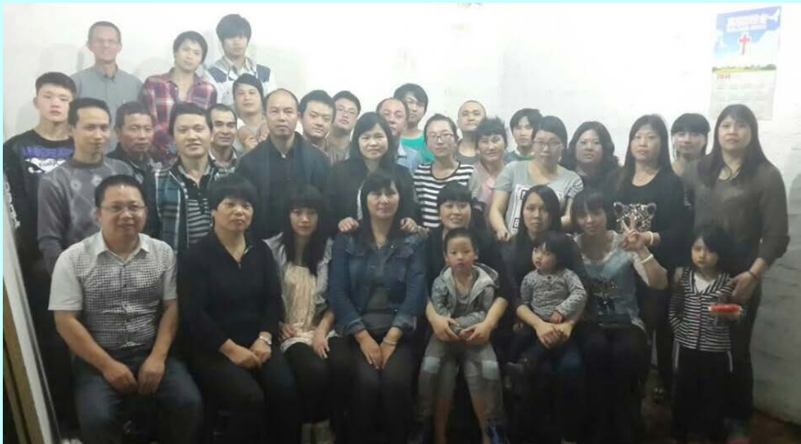
Evening service in Port Elizabeth