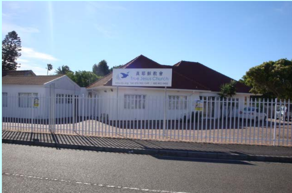
The chapel in Cape Town

The public safety in South Africa has become increasingly alarming. In 2014, several members were robbed, and some were beaten. We ask all brothers and sisters to pray for the brethren and churches in South Africa so that the members can live a stable life amidst an unstable environment. May God look after the development of the churches.