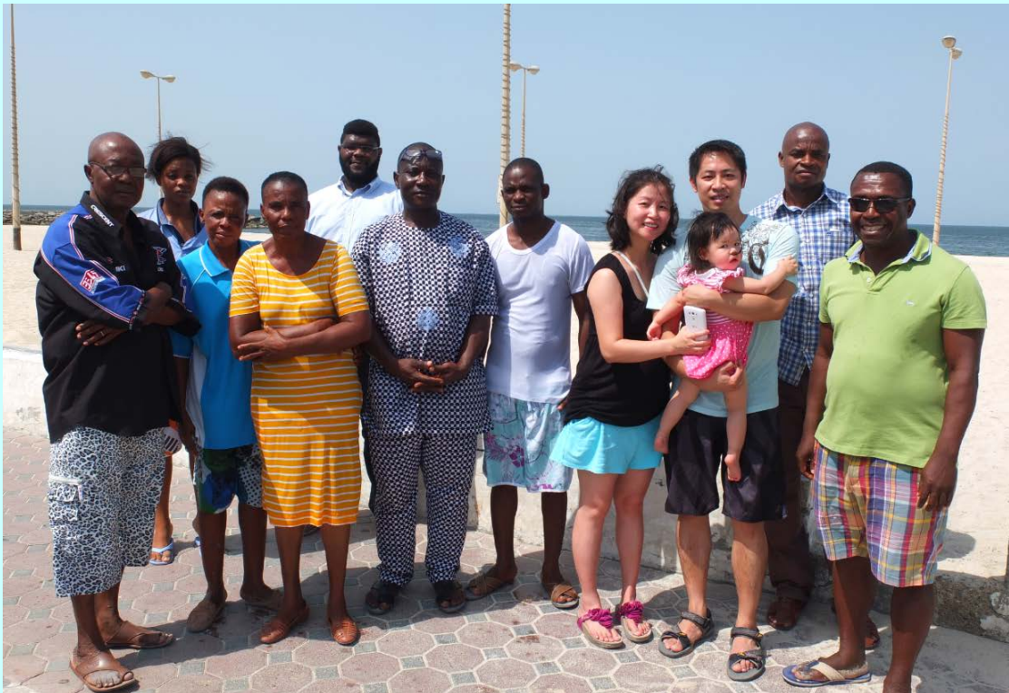
Photo taken at the first baptism conducted in Dubai