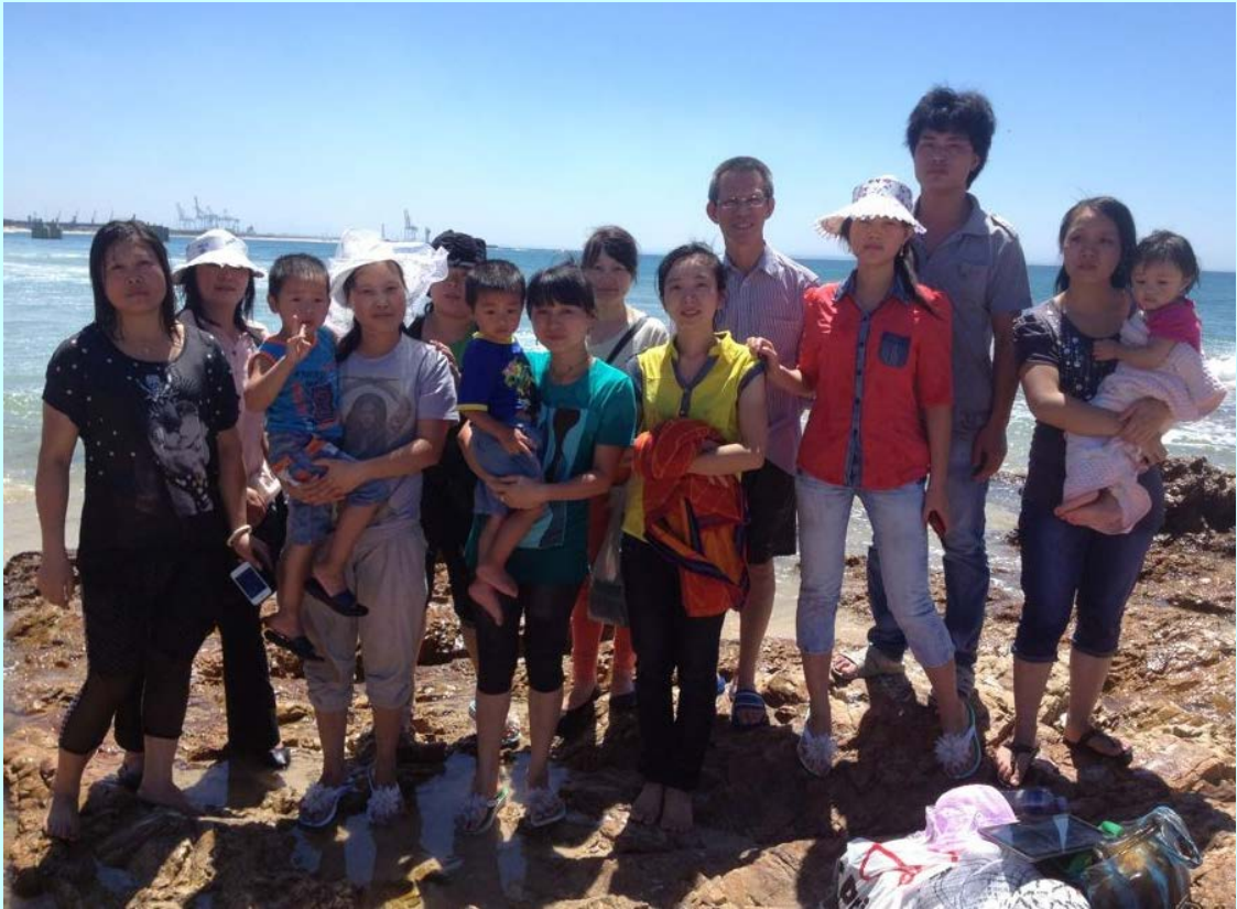
Baptism in Port Elizabeth